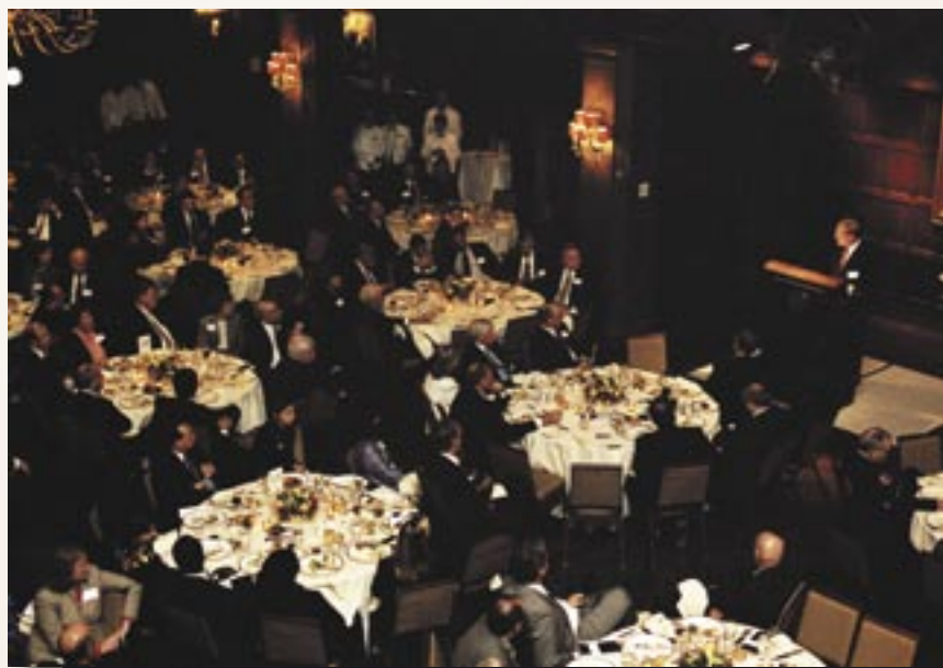
The stately setting of the Main Dining Room of the Harvard Club of New York City.